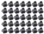
Production / Batch Parts

One off Parts, Express Turnaround Available