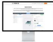
Have a CAD File & Need a Quote

1 - 100,000 Parts No Tooling Costs, No Set Up Fee